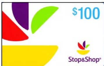
STOP & SHOP $100