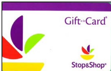
STOP & SHOP $300