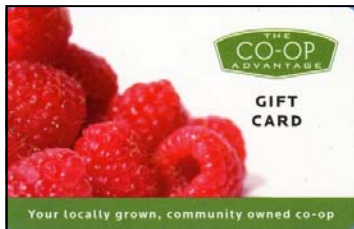
RIVER VALLEY MARKET $100