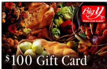
BIG Y $100